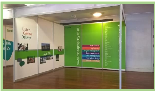
Example image of inserted graphics installed in a 3m x 3m open ended stand.

Panelled and seamless graphics start from just £189 per panel +VAT.