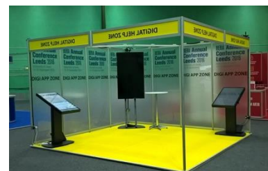
Branded wall panels

Please note full remittance for additional opportunities must be received by 02/09/2022