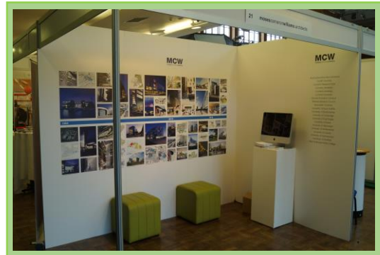
Example image of seamless graphics installed in a 3m x 2m open ended stand.

Artwork should be supplied fully designed and sent as a high-resolution pdf, with printer's trim marks and a 3mm bleed on all sides. Panelled graphics need a 3mm bleed on each side of the panel and seamless graphics would be set as complete wall widths, with a 3mm bleed around each side. Full artwork specification and details will be given upon enquiry.