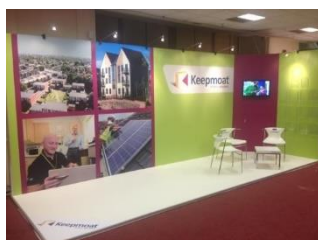
A branded floor